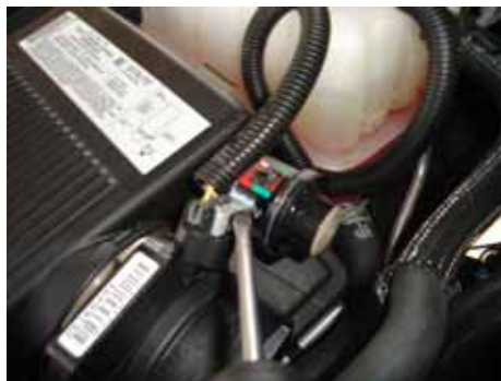
5. Remove the clip from the MAF sensor and unplug the sensor as shown.