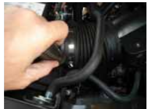
3. Loosen the hose clamp on the stock air tube that is attached to the stock air box as shown.