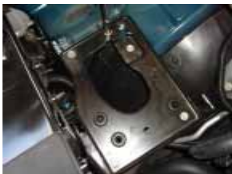
7. Once the stock air box is removed, remove the plate that held it in place and set aside hardware for reuse with the MAC system.