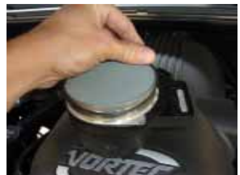
9. Install the rubber o-ring supplied in the kit onto the MAF meter as shown.