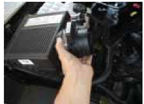
6. Remove the stock air box by pulling it straight up as shown.