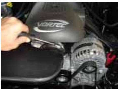
1. Start by loosening the hose clamp from the stock air tube to the throttle body as shown.