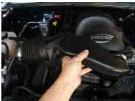
4. Remove the stock air tube as shown.