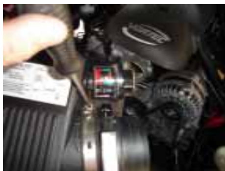
8. Remove the MAF meter from the stock air box for reuse with the MAC air system.