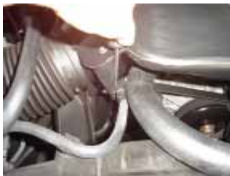
2. Remove the clip from the located on the coolant hose to the stock air tube as shown.